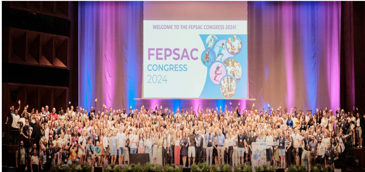
Image 1: Over 1,000 participants at the sport psychology congress in Innsbruck

Performance under pressure in sports ,military/police, performing arts, medicine, business and daily life.