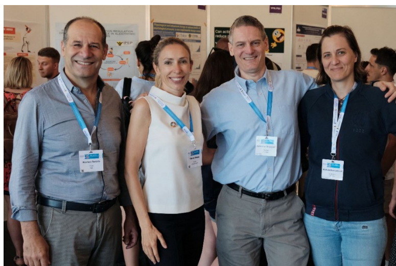
Image 12: FEPSAC Jury – Awards for Young Practitioners