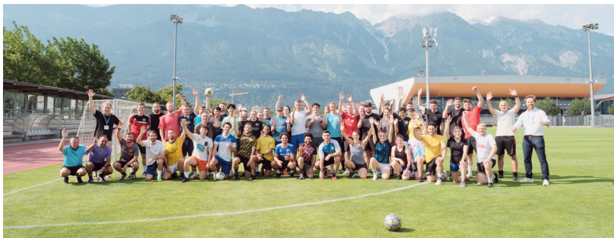
Image 13: First World Championship in Sport Psychology – Innsbruck Stadium